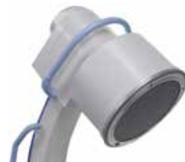
Image Intensified CCD ++ Image quality at Low dose – Bulky form factor – Distortions